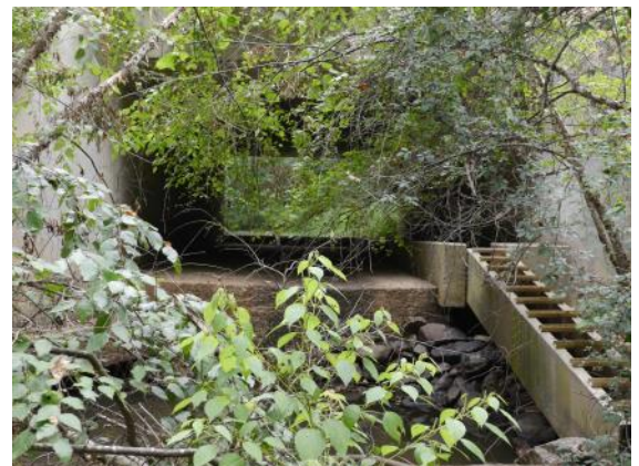
Fish Ladder in the Port Tobacco Creek