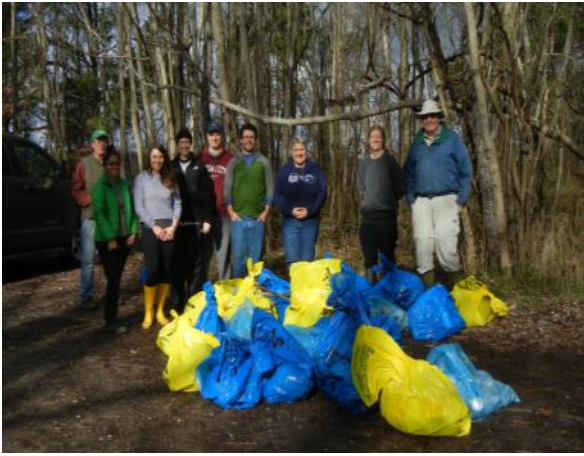
Chapel Point Cleanup in January